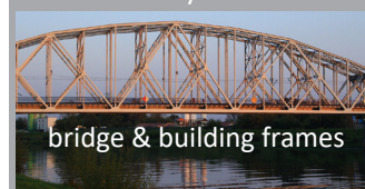
bridge & building frames